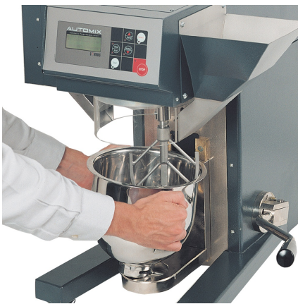
65-L0006/AM Easy removal of bowl and beater