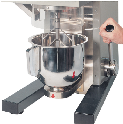
65-L0006/AM Detail of the bowl displacement by a vertical slide guide